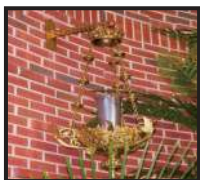
sanctuary candle $20