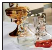
bread & wine $20