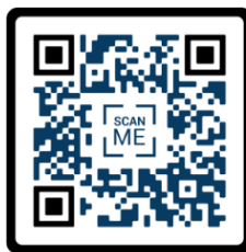
Best Place of Worship

Your vote helps others find their way here.