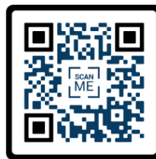
Best Private School