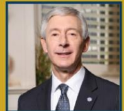
John McAfee Arrangements