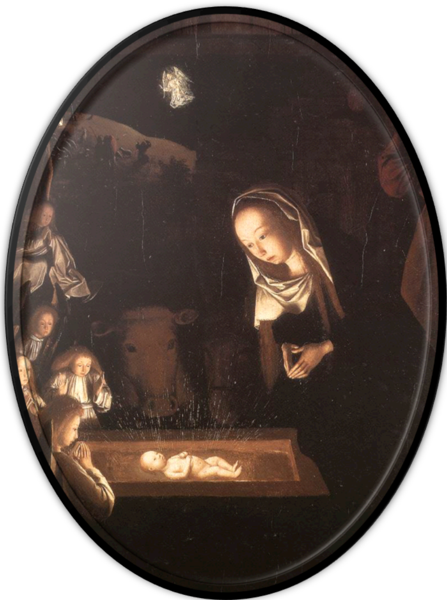
Nativity, at Night, 1484-90, Geertgen tot Sint Jans