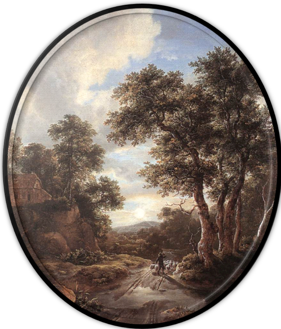
Sunrise in a Wood , after 1670, Jacob Isaacksz van Ruisdael