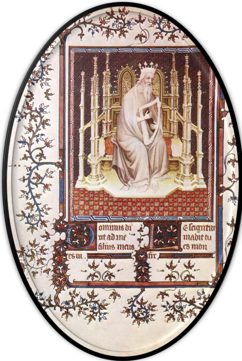
King David, by Andre Beauneveu, before 1402

December 20: O Key of David / O Clavis David