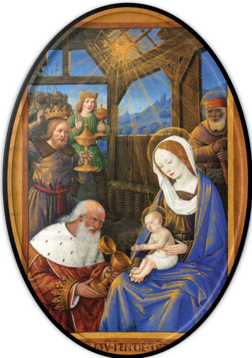
The Adoration of the Magi, Jean Bourdichon

December 22: O King of the Nations / O Rex Gentium