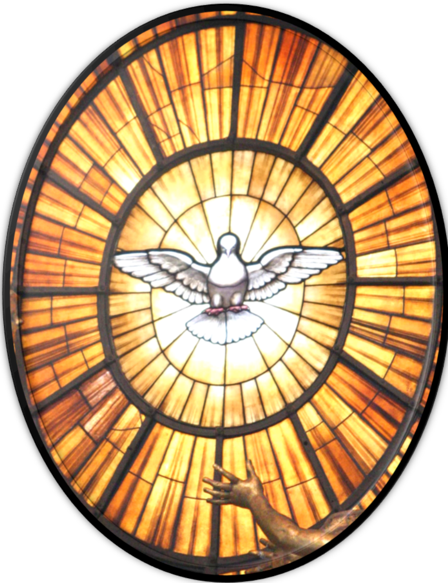
Alabaster Holy Spirit Window in St. Peter's Basilica, Vatican

Suggested Foods: a) "Brain food" such blueberries, tomatoes, dark chocolate, avocados and eggs. b) Symbols of the Holy Spirit such as a dove inspire poultry or "winged" ideas, such as chicken wings. c) Remembering the chrism at Baptism and Confirmation, serve bread slices to dip into flavored olive oil. d) God is also portrayed as the all-seeing eye, present eye-ball shaped foods (like stuffed olives).