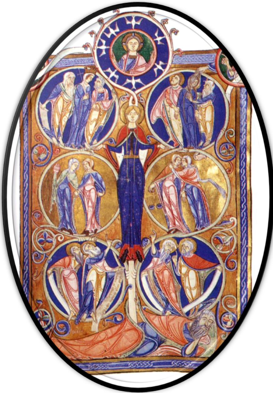
The Tree of Jesse, English Miniature Illuminated Manuscript 1140s

December 19: O Root of Jesse / O Radix Jesse