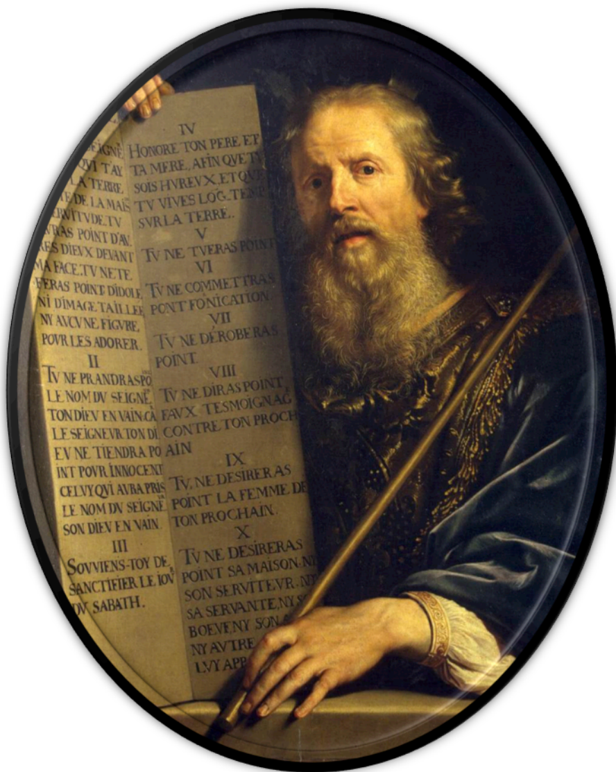
Moses with the Ten Commandments , 1648, Philippe de Champaigne

December 18: O Lord and Ruler / O Adonai