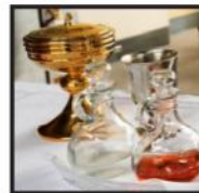
bread & wine $20