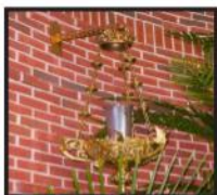
sanctuary candle $20