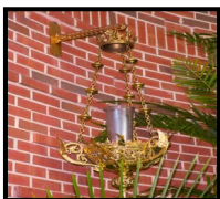
sanctuary candle $20