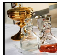
bread & wine $20