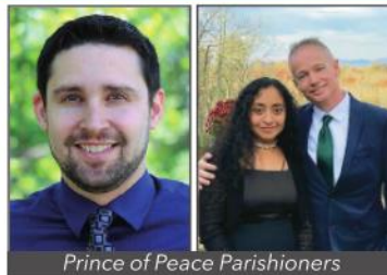
Prince of Peace Parishioners

864-896-7940 www.TwinFallsFamilyDentistry.com