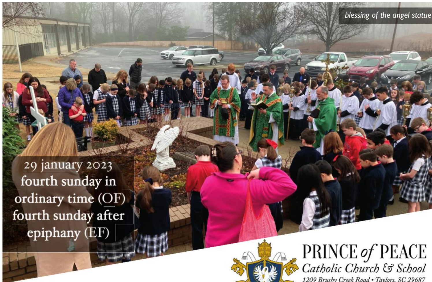
blessing of the angel statue

29 january 2023 fourth sunday in ordinary time (OF) fourth sunday after epiphany (EF)