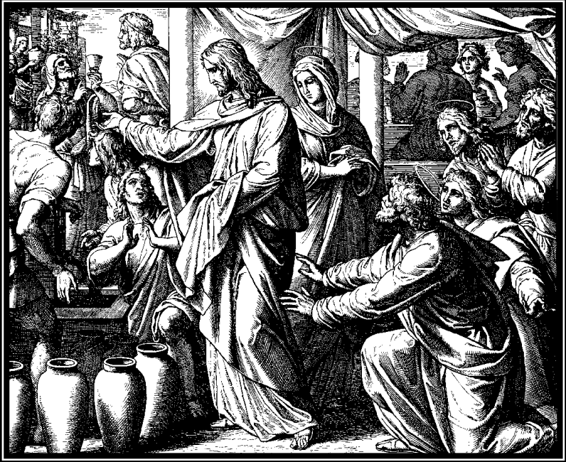
Woodcut for "Die Bibel in Bildern", 1860