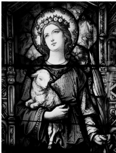
St Agnes of Rome, Virgin and Martyr Patroness of Engaged Couples Feast day 21 January St Agnes, beloved of God, pray for us.

MARY our Mother and Saint Joseph keep us always in love with each other. Teach us to live as you did and to love Christ with great devotion all the days of our life together. Amen.